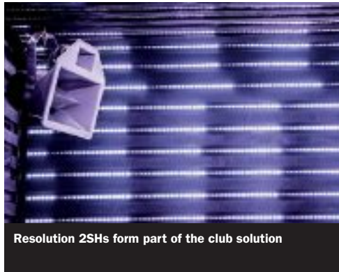
Resolution 2SHs form part of the club solution