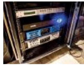
Funktion One and MC² equipment in the rack

The upstairs DJ booth features a pair of F81 speakers and a self-