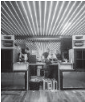
The Phuture Sound team installing the system