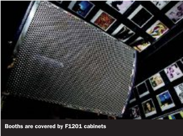
Booths are covered by F1201 cabinets